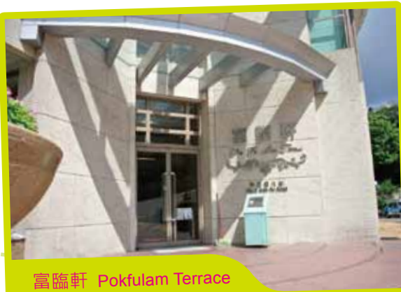
富臨軒 Pokfulam Terrace

Parkland and THL Cleansing Services Company Limited had recently been awarded new management contracts of Conifer Lodge and Pokfulam Terrace, and continued to be awarded three management and cleansing services contracts, namely Kennedy Town Community Complex, Sai Ying Pun Community Complex and Yuet Chui Court. We are dedicated to providing comprehensive quality property management and cleansing service to our clients.