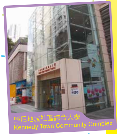
堅尼地城社區綜合大樓 Kennedy Town Community Complex