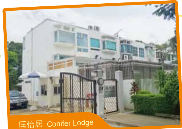
匡怡居 Conifer Lodge