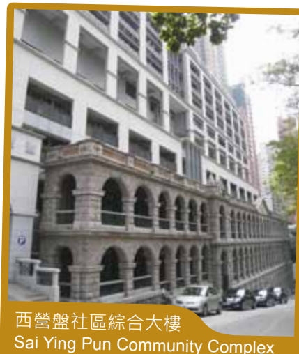
西營盤社區綜合大樓 Sai Ying Pun Community Complex